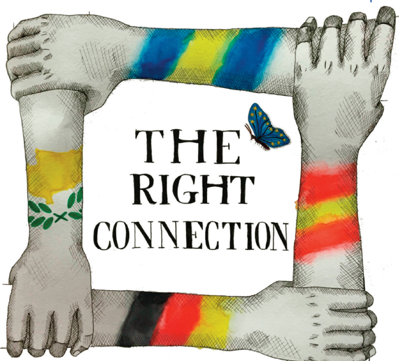
Limassol - Cyprus