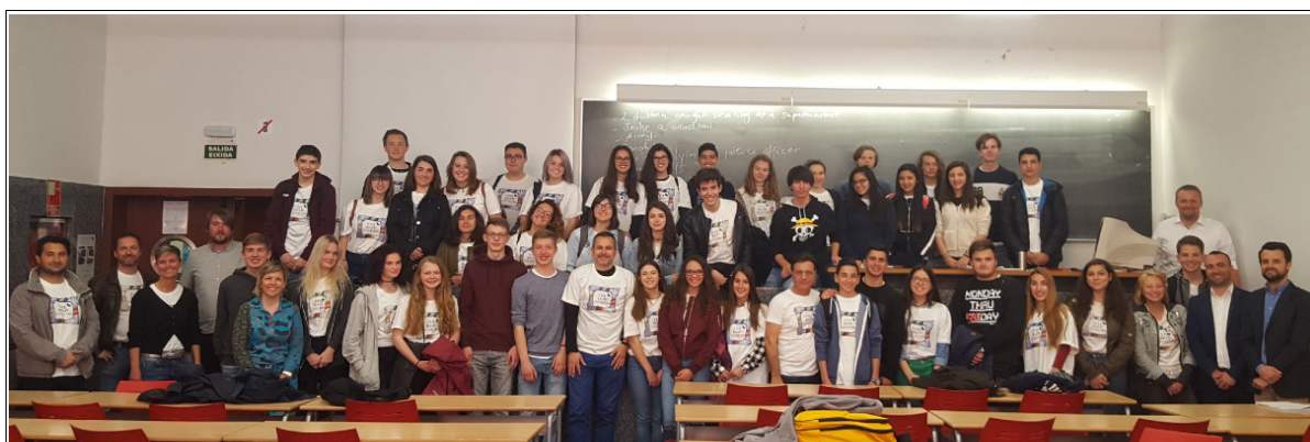
Participants of the Project at the Human Rights Institute University of Valencia, March 2017

Now, we wish all the participants and the readers an enjoyable time while reading our project booklet.