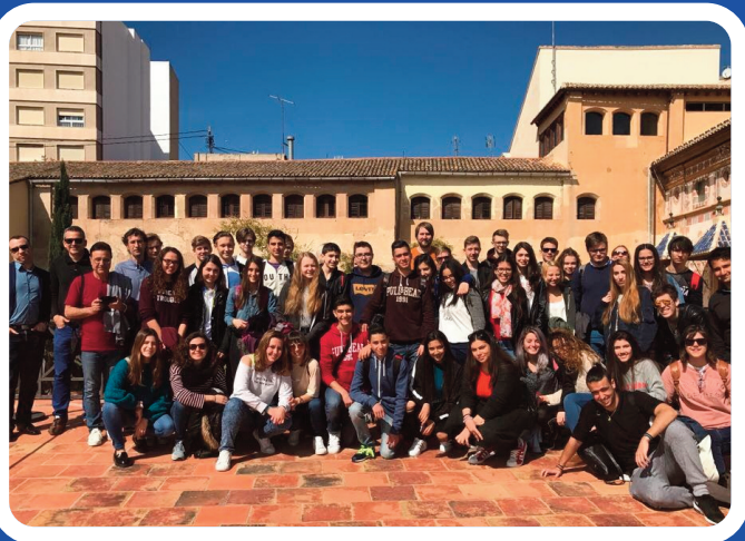
Gandia - Spain