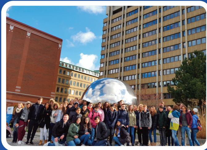
Partille - Sweden