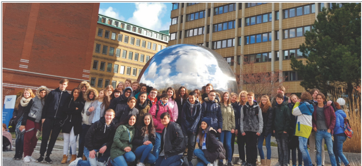
Field trip to Svenska Kullagerfabriken

Finally, the students attended lessons units on human rights which were taught in team-teaching during four different “learning, teaching and training activities”. The whole project as well as the lesson units were supervised by a team of teachers with different subjects such as Modern Languages, Social Studies, Natural Sciences, Religious Education, History, Arts, Geography, Computer Science and Physical Education.